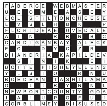
Solution Polymath 952

The 13th edition (2014) retains the much-loved features of The Chambers Dictionary , including the unique quirky definitions for certain words. There are more than 1,000 new words and meanings, and there is also a new Word Lover's Ramble, showing how English words and definitions have changed over the history of the dictionary.