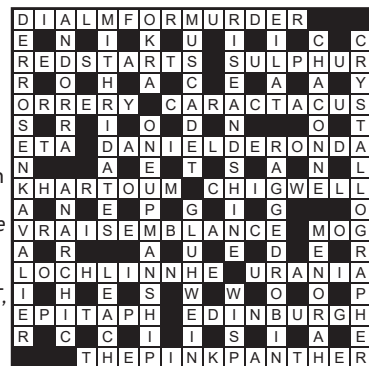
Solution Polymath 1,012

Brewer's Dictionary of Phrase and Fable takes you on an adventure through language, culture, myth and legend. Edited by Susie Dent, this edition contains a supplement of Brewer's Gems – facts, fables and curiosities from Brewer collections of the past. www.chambers.co.uk/brewers.php